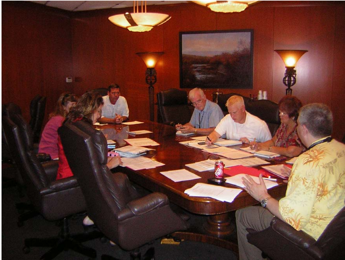
Staff working the exercise