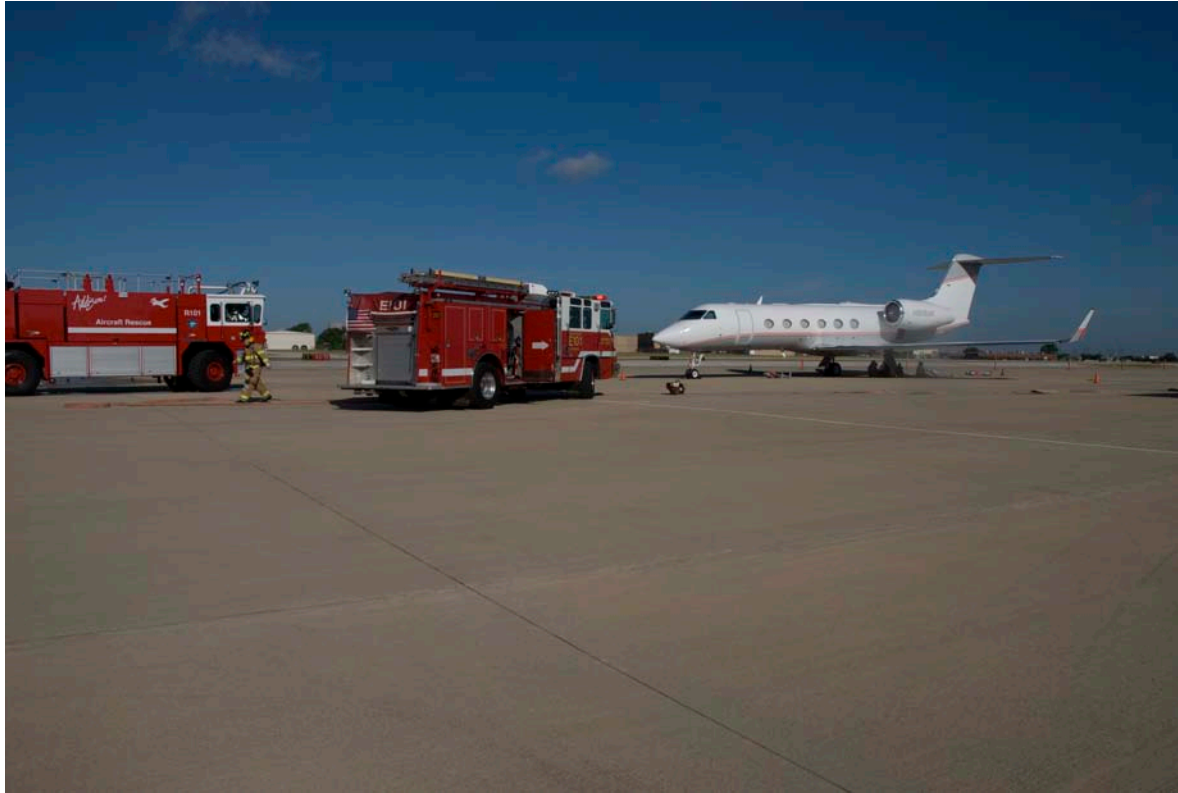
Initial Arrival of Fire Trucks