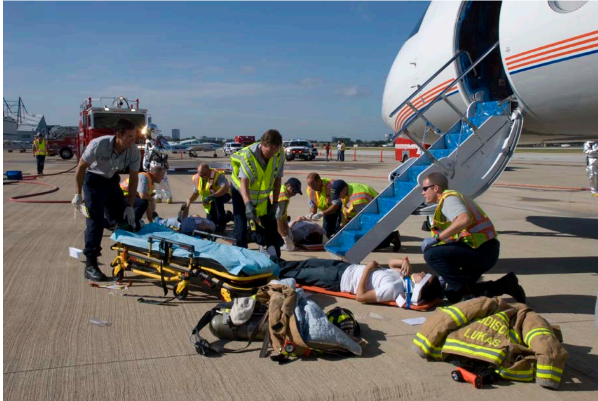
Multiple injured being assisted