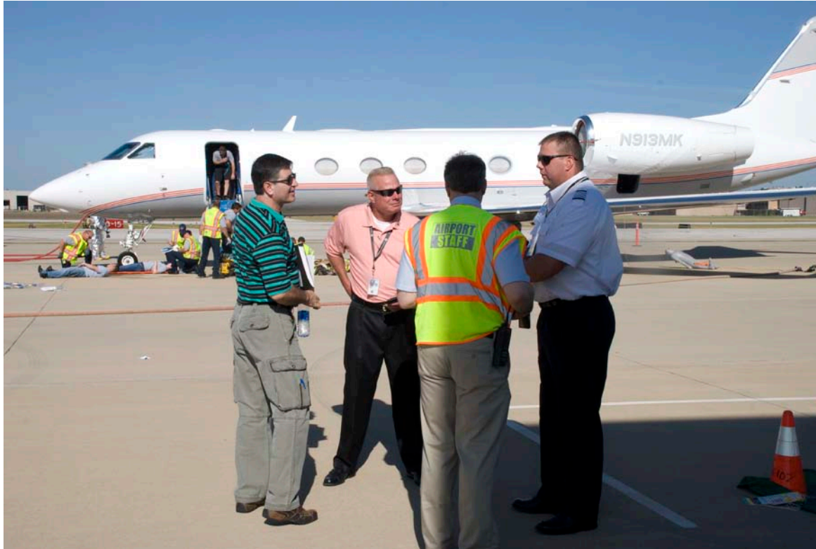
Surviving crewmember being interviewed by FAA