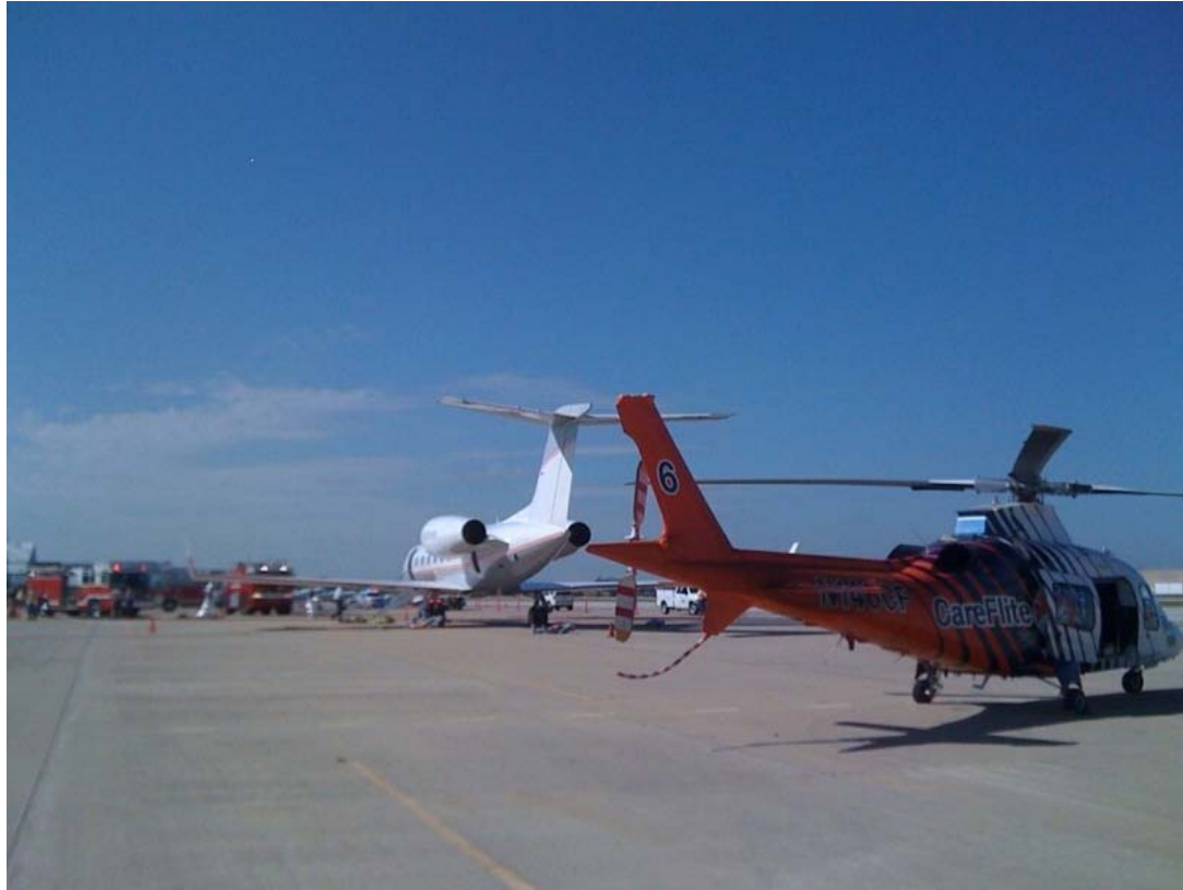
CareFlite participated in drill