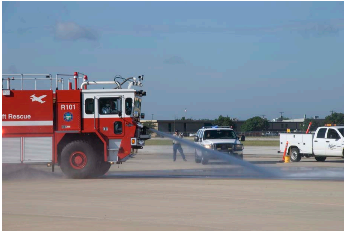
Simulation of putting a fire out at the scene