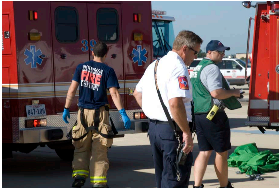
Chief Assessing the drill