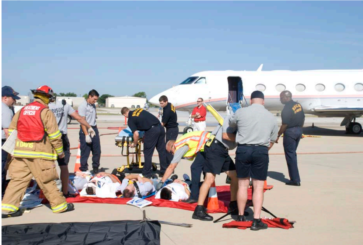
Treatment Officer assessing scene