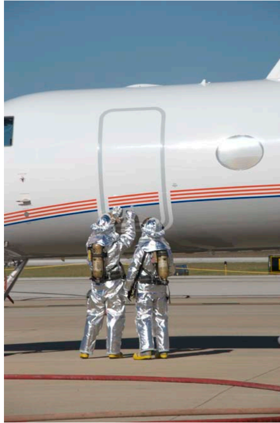
Firemen accessing the Aircraft