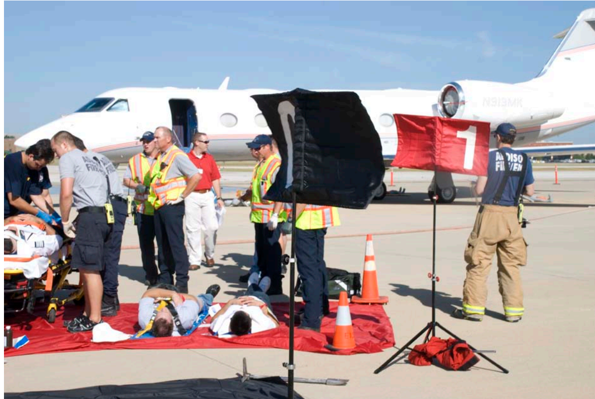
Emergency Responders set-up Zones