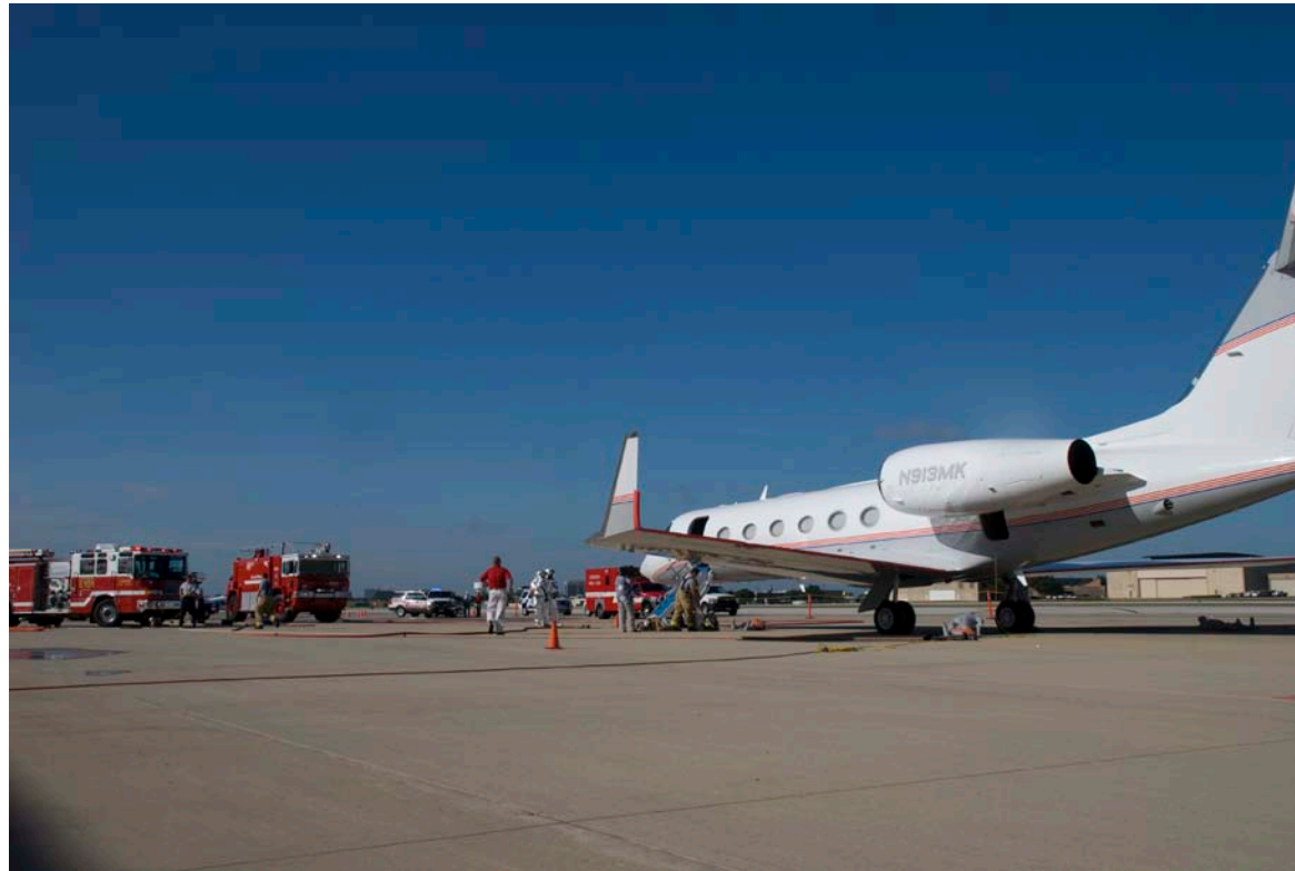
Firemen rescuing victims