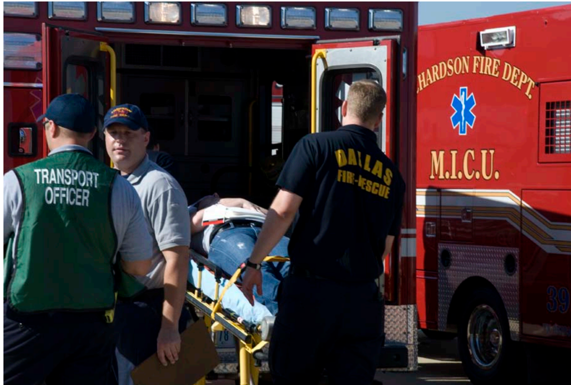
Transport Officer working with EMTs