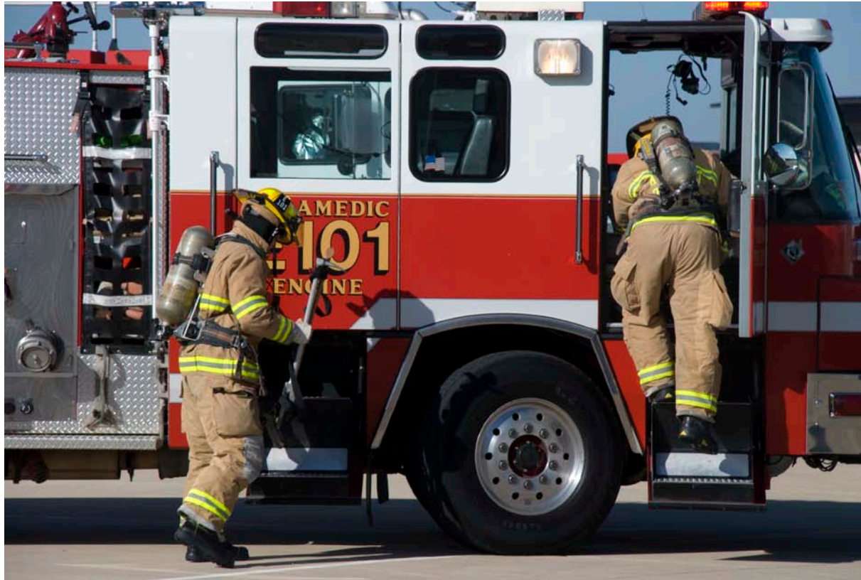
Firemen ready to deploy on the scene