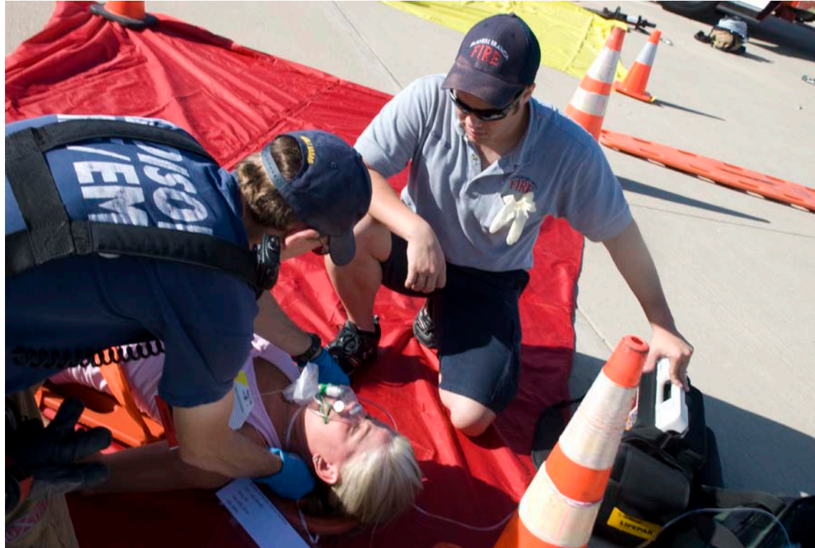
EMTs assisting victims