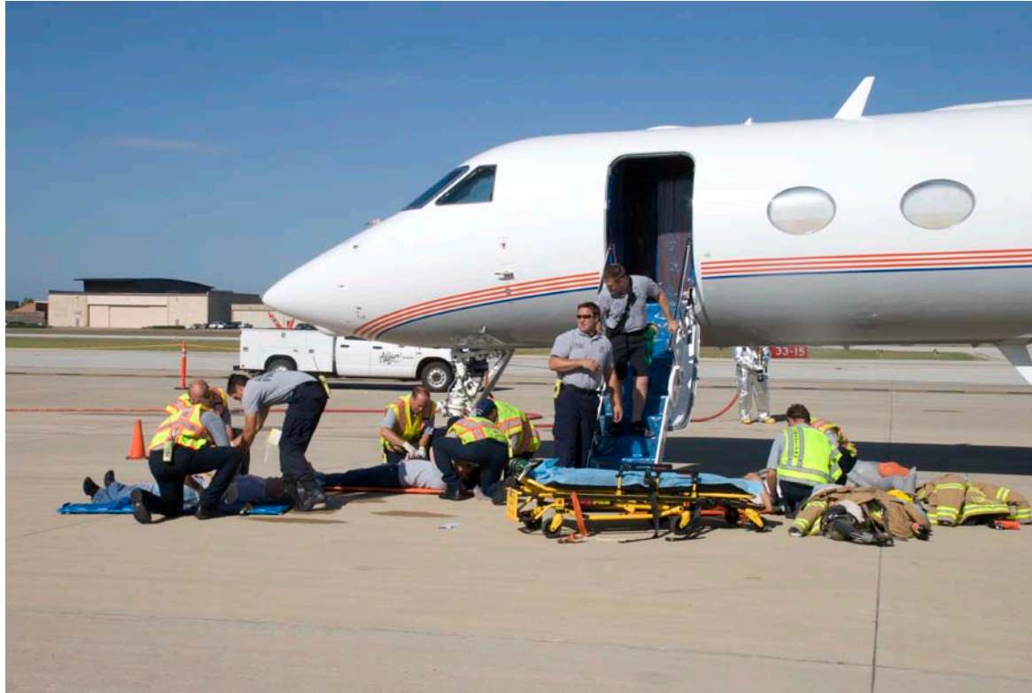
Firemen & EMT rescuing victims